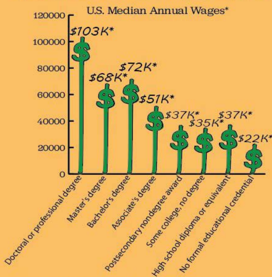
*U.S. Department of Labor Statistics, Occupational Employment Statistics program, 2016 *Median annual wages corresponding to typical entry-level education survey sample; dollar amount rounded to the nearest whole number