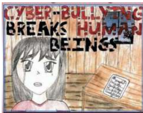
(2017 Contest Winer)

Sponsored by the Arizona Department of Administration, The Arizona Department of Education, LifeLock, and Arizona One Credit Union, the Arizona “Kids Safe Online” Cyber Security Awareness Calendar Contest is once again accepting student art!