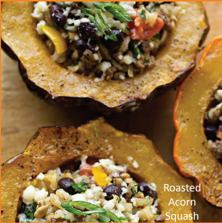
Roasted Acorn Squash

Choose winter squash heavy for its size and very hard. Press firmly to test the firmness of the rind.