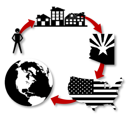
Focus progresses from individual students to worldwide view with each grade